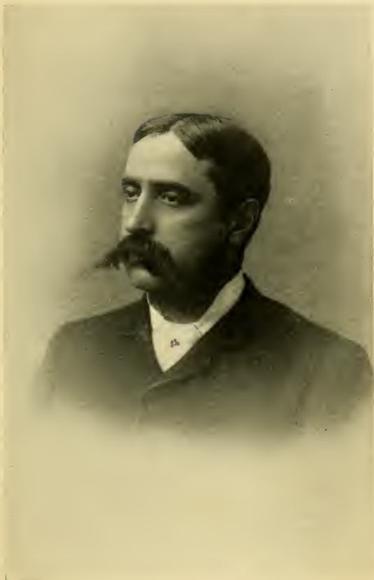
BRIGADIER-GENERAL WILLIAM LUDLOW, U. S. V.